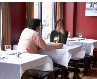
Dinerware creates a seamless experience for you, your staff and customers.

Dinerware restaurant POS software helps streamline your business and enables you to focus on what is important: your customers.